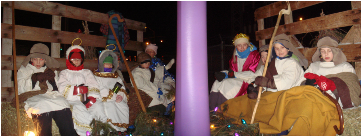
Floating through Arnprior during the 2010 Santa Claus Parade!

After thirty years, the time to renew our vestments and hangings provided an opportunity to use the Emmanuel Memorial Fund for its intended purpose. On All Saints Sunday, October 31st, four sets of vestments in the traditional colours, along with burses and veils and altar superfrontals were dedicated to the Glory of God and in Loving Memory of those in whose names funds have been contributed to the Memorial Fund. The renewal of the beauty of God's House and the vestments worn for the Liturgy remind us that when we worship, we offer God our best as we give the gifts, not only of outward things, but of our hearts and lives.